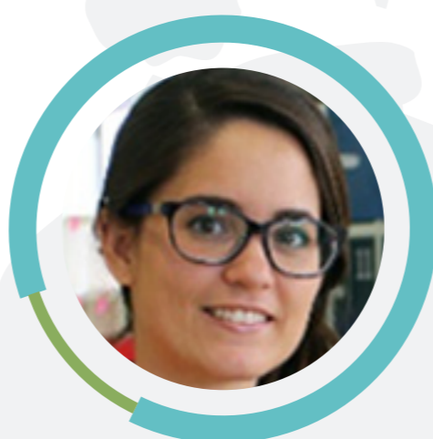
RAQUEL SERRANO LLEDÓ CEO of FIIXIT, Spain

Expanding access for people living with disabilities.